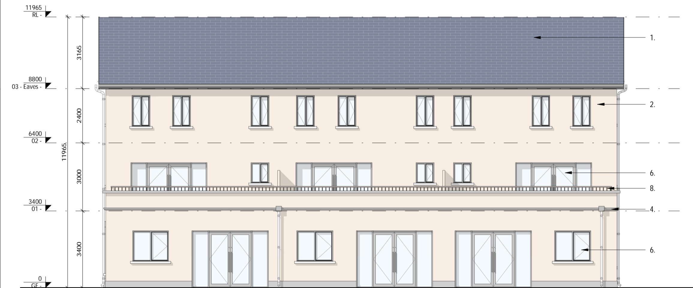
4 Rear Elevation 1:100