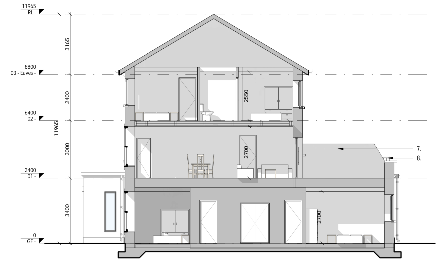
3 Section AA 1:100