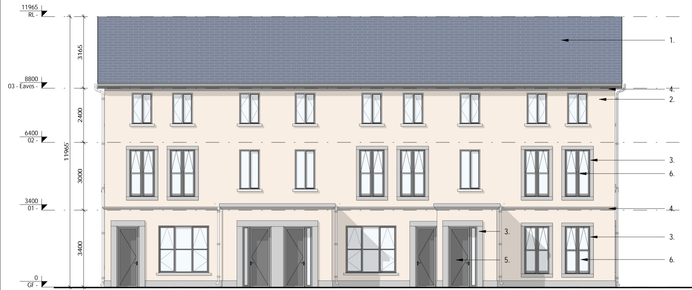
1 Front Elevation 1:100